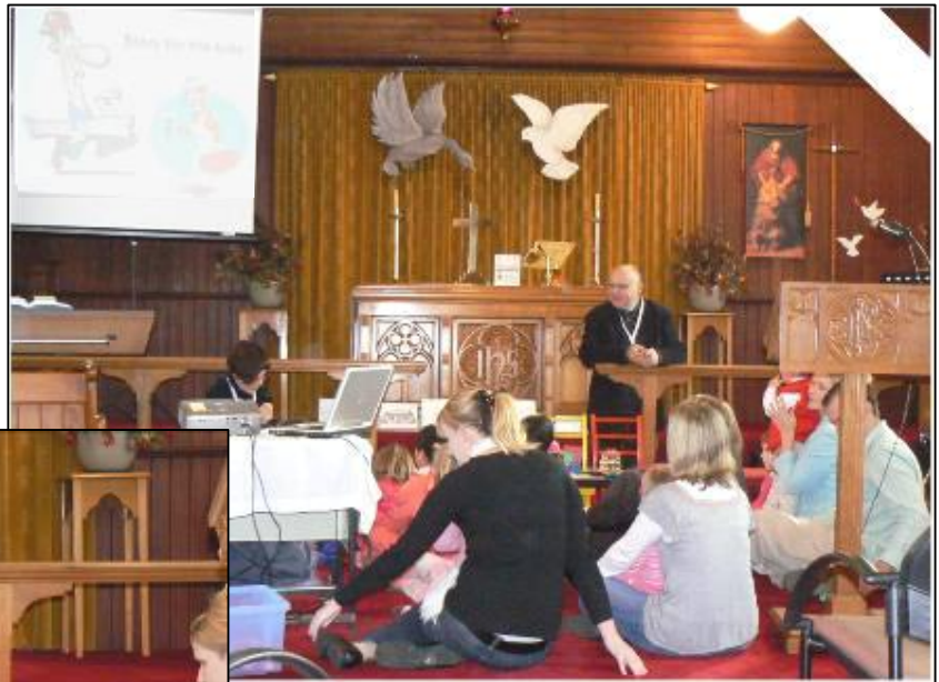
The wise & foolish builders Matthew 7:24-27